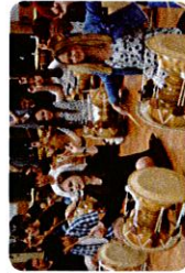
Korean Culture Experience