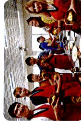
Making Korean Food